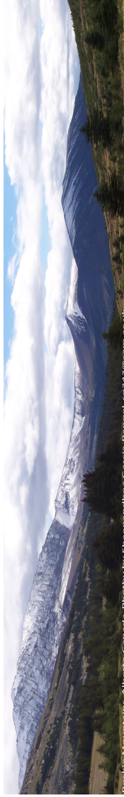
Rocky Mountains, Alberta, Canada.

Planning for the workshop is proceeding. In June, we will be formally commencing the work of our email based Workshop Steering Committee. Newsletter No 3 will provide you the details.