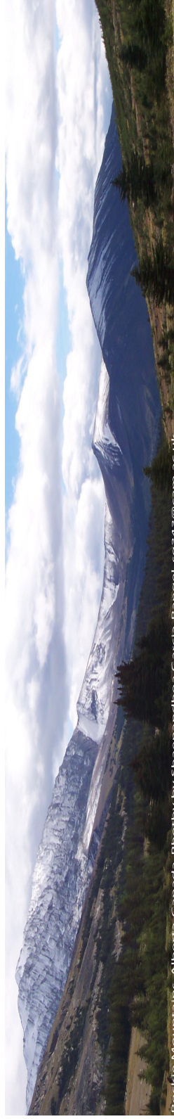
Rockie Mountains, Alberta, Canada.

Planning for the workshop is proceeding. In June, we will be formally commencing the work of our email based Workshop Steering Committee. Newsletter No 3 will provide you the details.