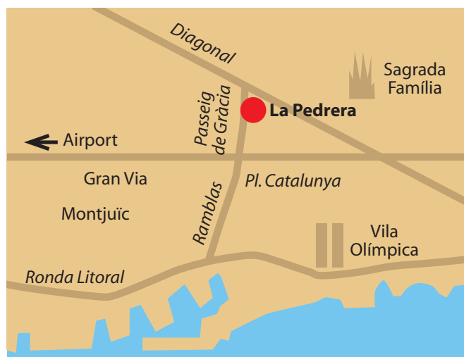
▲ Location of La Pedrera (Passeig de Gràcia, 92). Barcelona.